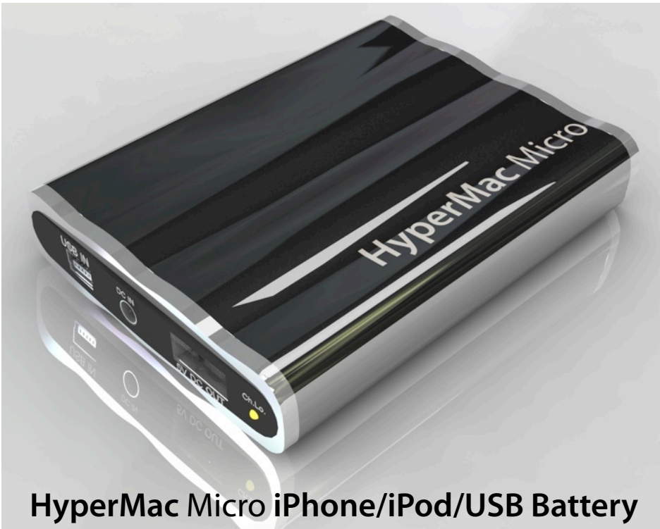
HyperMac Micro iPhone/iPod/USB Battery